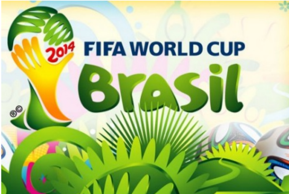
FIFA World Cup

Brazil 2014 is in the knockout stages. Brazil's team is through to the quarter finals, much to the joy and delight of home fans. Yet to what extent can Brazilians actually celebrate? The tournament has come at much social and economic cost.